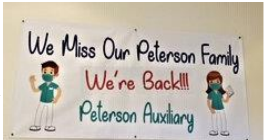
Banner hung in the halls of Peterson hospital and at the Ambulatory Care Center September 14, after the auxiliary returned.

After September 14th, the banners honoring Peterson employees were modified to reflect that the Peterson Auxiliary was back. Peterson employees were very appreciative of the banners and cookies and still talk about it today. The steps taken to remain active in early September, we believe, helped create an even stronger bond between the Peterson employees and the Volunteers.