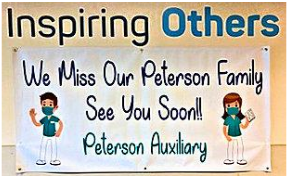
Banner hung in the halls of Peterson Hospital and at the Ambulatory Care Center September 1.

* In late August, the Executive Board sent a "checking in" note to all members (picture, below).