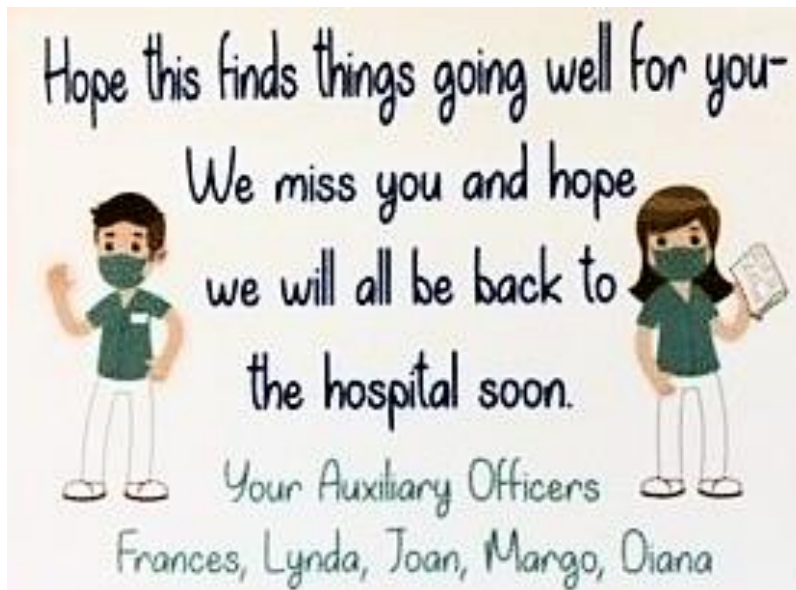
Postcard sent to every member of the Peterson Auxiliary in late August.

After September 14th, the banners honoring Peterson employees were modified to reflect that the Peterson Auxiliary was back. Peterson employees were very appreciative of the banners and cookies and still talk about it today. The steps taken to remain active in early September, we believe, helped create an even stronger bond between the Peterson employees and the Volunteers.