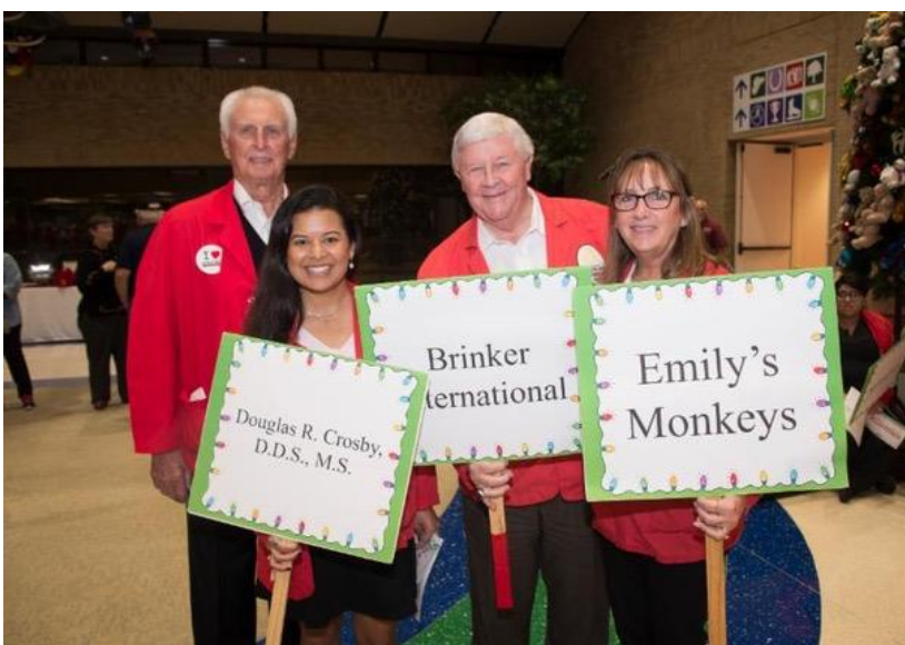
Tree decorating with evening volunteers.