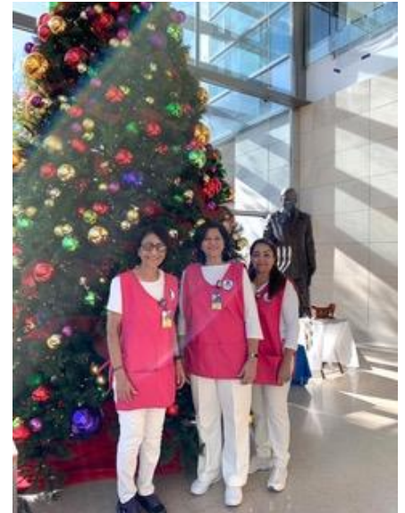
Newborn Intensive Care Unit Volunteers/Baby Rockers