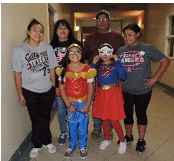
Graduates from NICU...growing up.

Of course, there was food, and there were many games and face painting to entertain the children. They even had two gentlemen who made animals out of balloons. This was a great event and the volunteers love to participate because of these wonderful children.