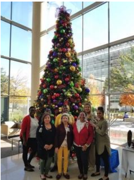
Parkland Auxiliary Gift Shop Volunteers

This time of year, the Parkland Auxiliary erects a Christmas Tree, Menorah for Hanukkah, and Kinara for Kwanzaa in our main lobby to greet patients, visitors, volunteers, and employees 24/7. Our photos depict spirited and invaluable NICU volunteers (Baby Rock-ers) Auxiliary Gift Shop Staff, and Medical Records Hospital Staff pausing to pose expressing our coined "Parkland Pride". We, as our TAHV family, demonstrate the practice of inclusion and diversity.