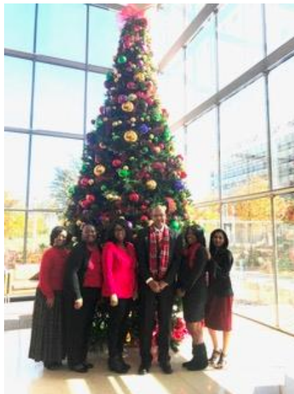
Medical Records Department