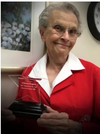
2017 Volunteer of the Year Award