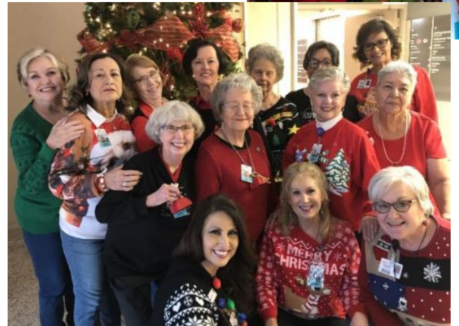
Volunteers participated in the MCHS Karaoke Contest where they sang "The 12 Days of Christmas" and won $1000 to donate for a volunteer falling on hard times.