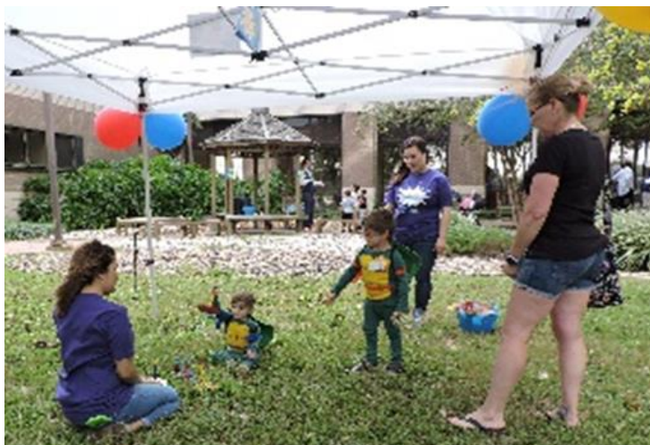
Children playing at the reunion.

On November 3 rd , a windy and cloudy Saturday afternoon, CHRISTUS Spohn Hospital Corpus Christi-South volunteers were involved helping with this wonderful event. Some popped and gave away boxes of popcorn, some helped with registration. Others were involved with giving away t-shirts and totes to the children and families who came for the NICU Reunion. This is always an exciting time for these children who were preemies at birth. Some of these children have survived overwhelming odds. Nurses who cared for them at birth and while hospitalized were present also. Watching them interact with these children was amazing. This year's theme was "Super Heroes". The children came dressed in costumes and looked so cute.