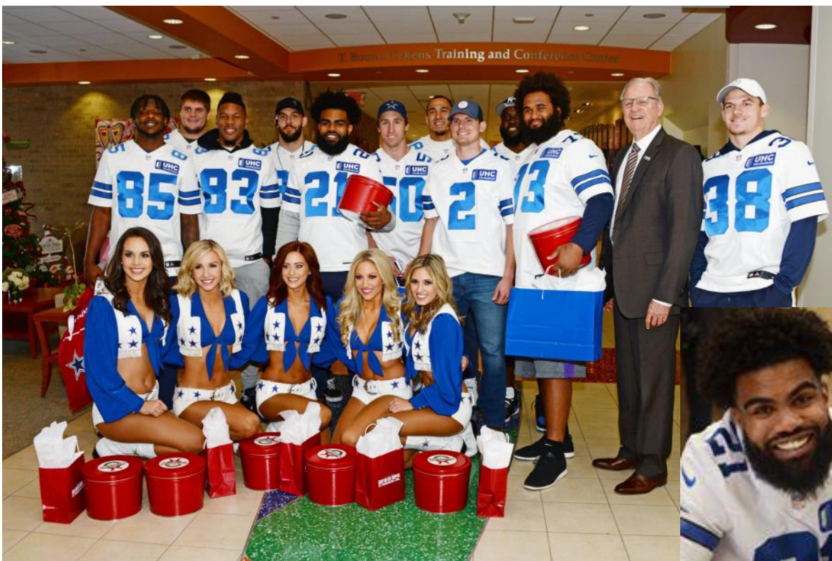
Dallas Cowboys and Cheerleaders

The winter holidays start early at Texas Scottish Rite Hospital for Children in Dallas . On November 12, the evening volunteers staged their annual In-Patient Parade through the hospital, complete with floats, a drill team, and cheerleaders to keep parade-goers excited. Later the same week, the volunteers held the Hearts and Hands Holiday Bazaar, Silent Auction, and Luncheon, a four-day event that raised $30,000 this year from sales of donated and handcrafted items. After Thanksgiving, our volunteers helped community groups at Tree-Decorating Night, which has grown to 600 people decorating 58 themed trees throughout the hospital. Most recently, we were one of the local children's hospitals visited by the Dallas Cowboys and Cheerleaders on December 3. The patients, their families, staff and volunteers were excited to get autographs and have their pictures taken with players and cheerleaders. We gave them all some popcorn to take home!