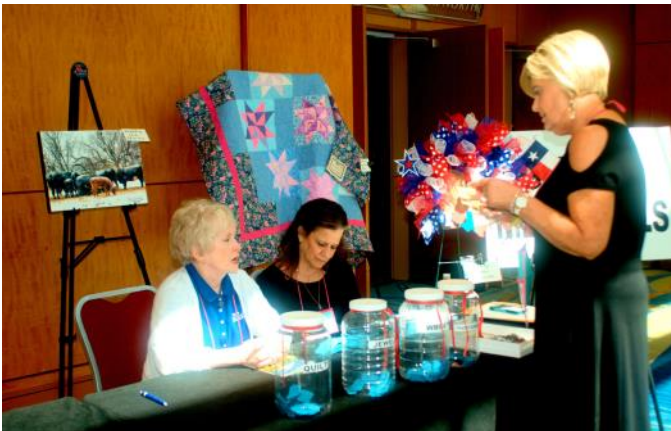
Raffles by Gifts & Memorials Foundation and Educational Topics for Volunteers (ETV):

President's Party and EVERYBODY in attendance took advantage of the accessories and picture possibilities with their friends and fellow volunteers!!!!