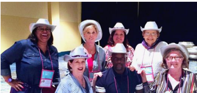
"Boot Scooting" at the President's Party (with a MOST delicious Texas style STEAK dinner) Pictured are the cowgirls from Parkland Health & Hospital System, Dallas