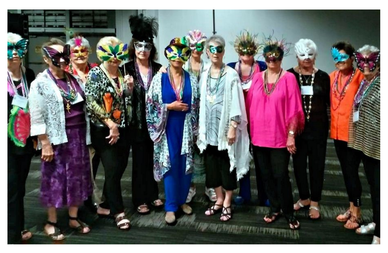
The Shannon Group came ready to party at the President's Bash!