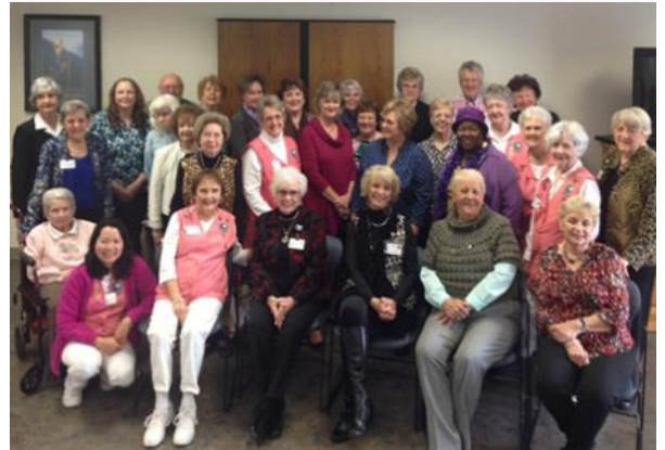
During the brunch, entertainment was provided by the Nacogdoches High School "Note-Ables" Encore

happen beyond the auxiliaries to best serve the community.